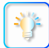
Colour Temperature: RGBW