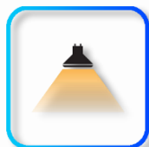
Beam angle: 120°