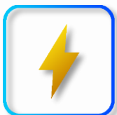
20W Power Consumption