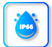
IP 66 Water & Dust Resistance