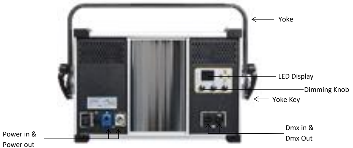
DMX Input 5 Pin XLR Socket